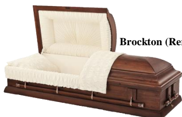
Brockton (Rental) 246588