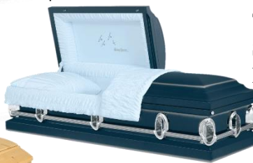
Going Home 71005885