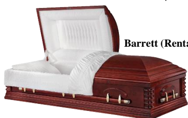
Barrett (Rental) 71086169