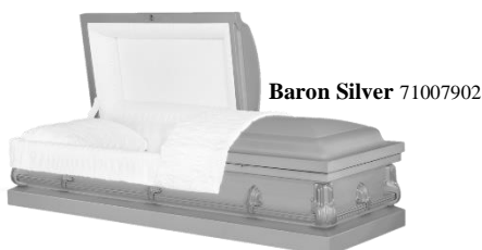
Baron Silver 71007902